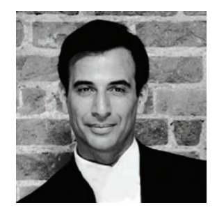
Craig Mokhiber Office of the High Commissioner of Human Rights<sup>1</sup>

Today, it is simply a fact of life that older people live longer, work longer, and contribute longer. As the past High Commissioner for Human Rights Navi Pillay said, 'the irony of the elderly being increasingly excluded from the very societies and institutions that they have built is too tragic to ignore.' And so it is.